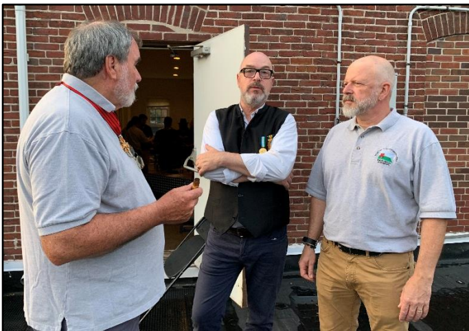
The Ephorate consult on the roof of the Maennerchor, September 9, 2023.